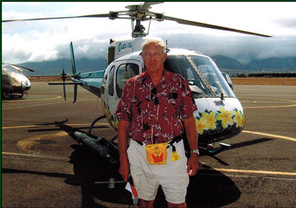
Maui helicopter tour, Maui, 2008.