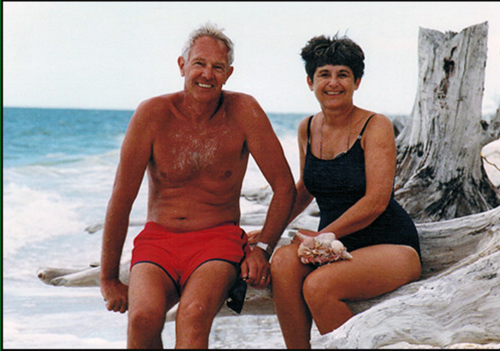
At Lovers Key, Bonita Springs, 2000.